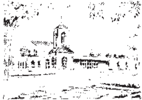
Our Lady of the Lake 129 Metro Road North, Keswick, ON L4P 3C8 Office: 905-476-0097 Fax: 905-476-0897