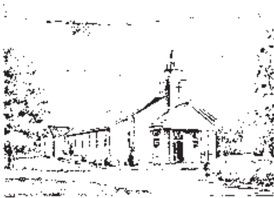
Immaculate Conception 20916 Dalton Road, Box 128, Sutton West, ON L0E 1R0 parish@immaculateconception.on.ca